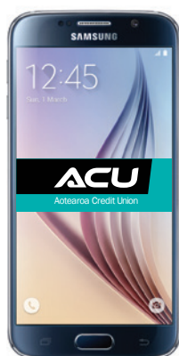
Samsung Galaxy S6

Grab a smart phone the smart way with an ACU personal loan*.