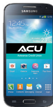
Samsung Galaxy S4 Mini