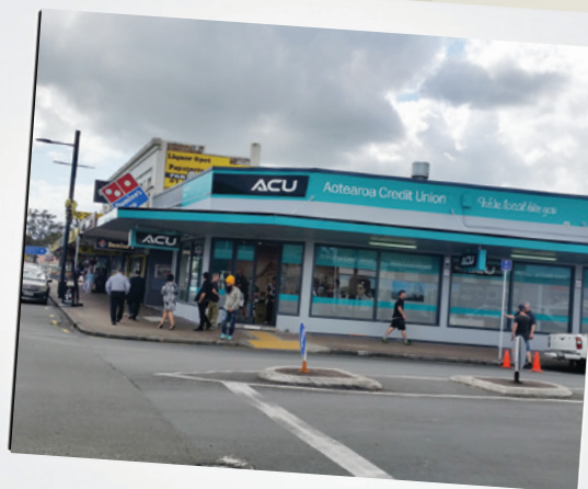
Applying signage to windows and walls