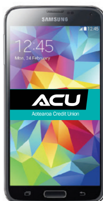
Samsung Galaxy S5

16gb / 2gb RAM up to 128SD 16/2 megapixel cameras