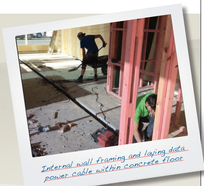
Internal wall framing and laying data power cable within concrete floor